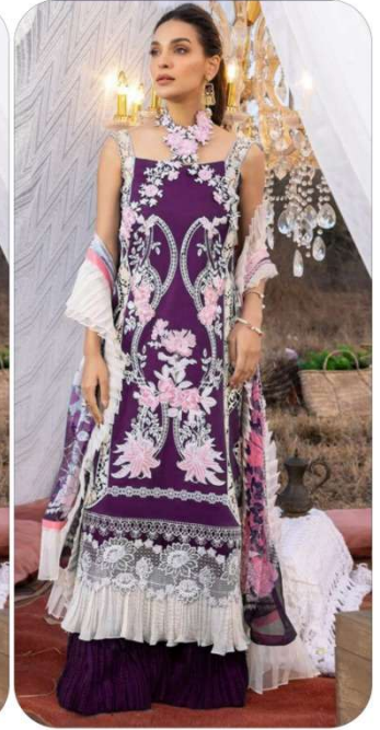
D.No | 224-D