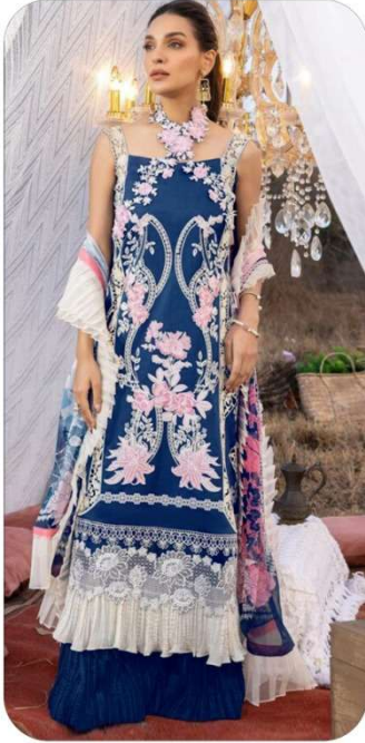
D.No | 224 A