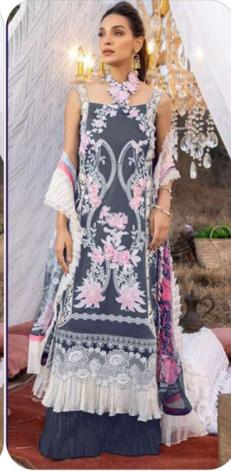
D.No | 224-C