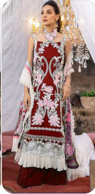
D.No | 224-B