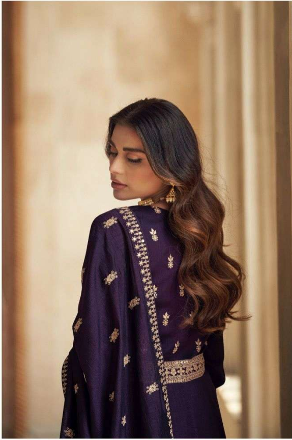
A | -9641