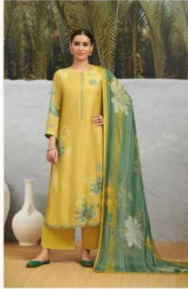
• 536 •