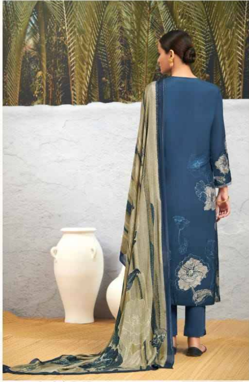
• 556 • MAHI