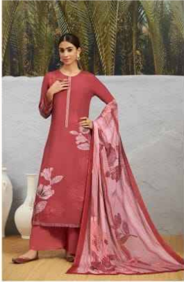
• 518 •