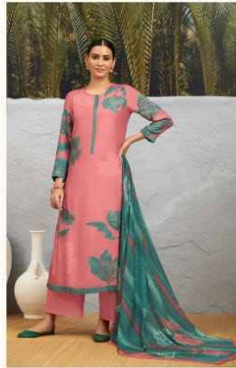
• 507 •