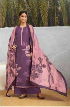
• 512 •