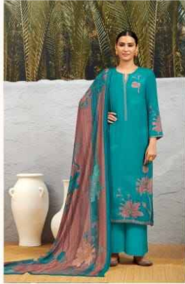
• 548 •