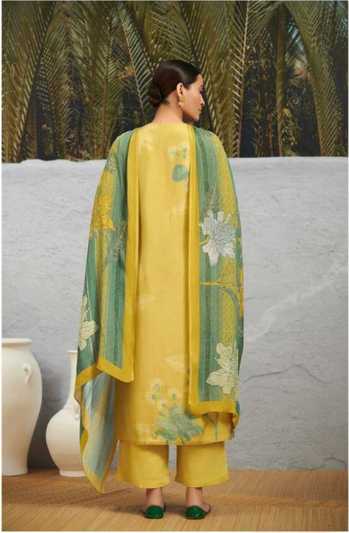
• 536 • MAHI