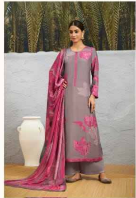
• 530 •