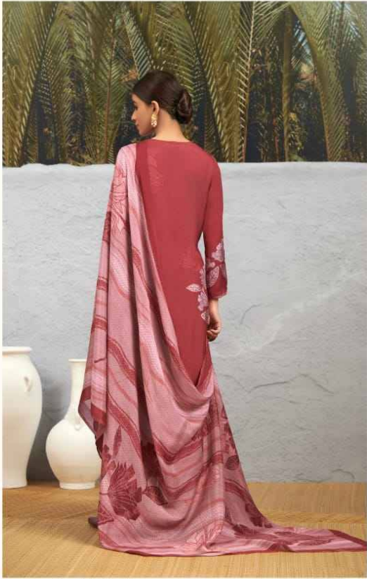
• 518 • MAHI