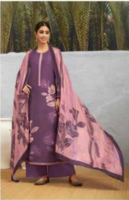
• 512 •