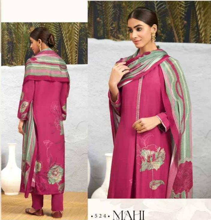
• 524 • MAHI