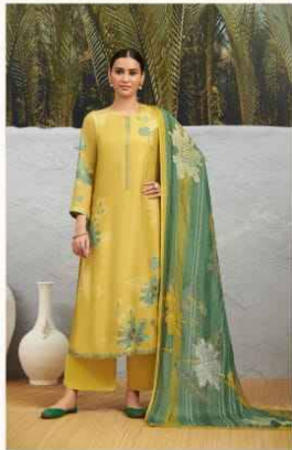
• 536 •