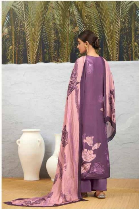
• 512 • MAHI