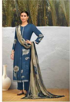
• 556 •