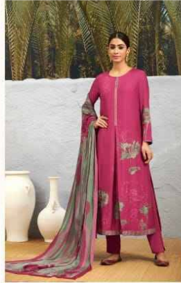
• 524 •