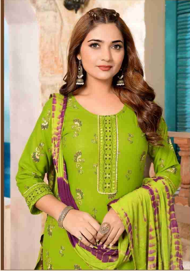
our elegant style and fashion patterns define true quintessence in women