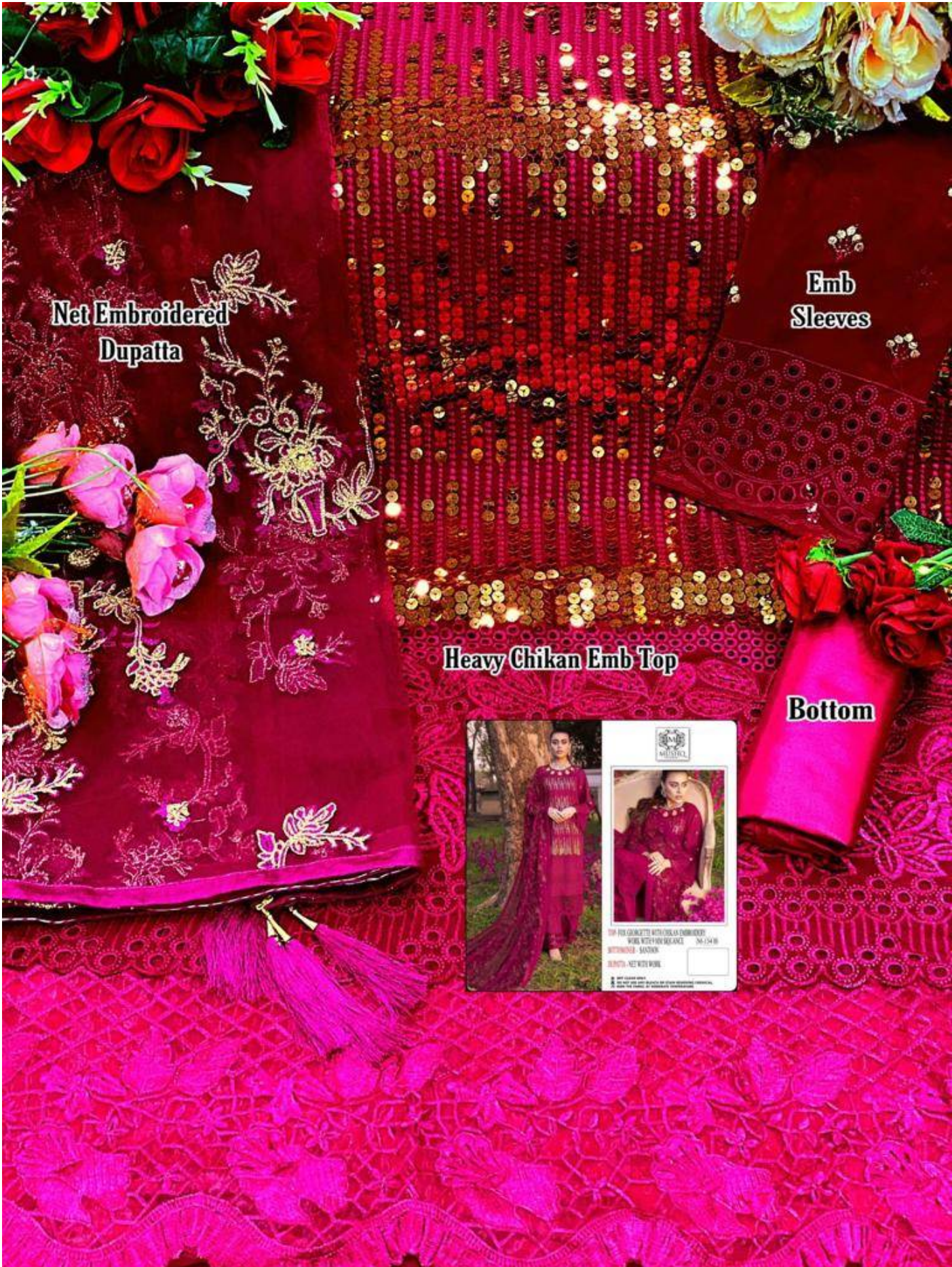
Net Embroidered Dupatta