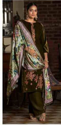
▪ 185 005 ▪