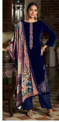
▪ 185 002 ▪