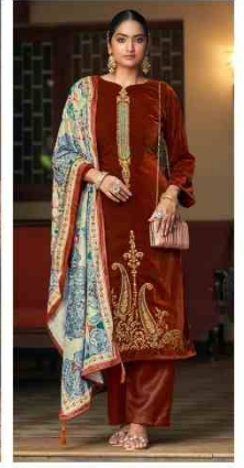
▪ 185 003 ▪