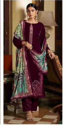
▪ 185 006 ▪