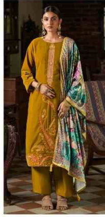
▪ 185 001 ▪