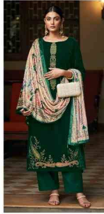
▪ 185 004 ▪