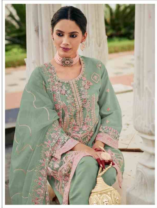
MR -122 C