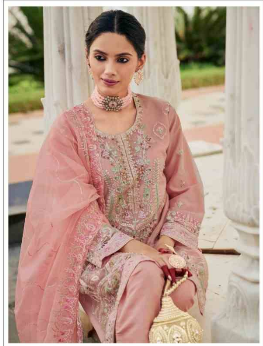
MR -122 A