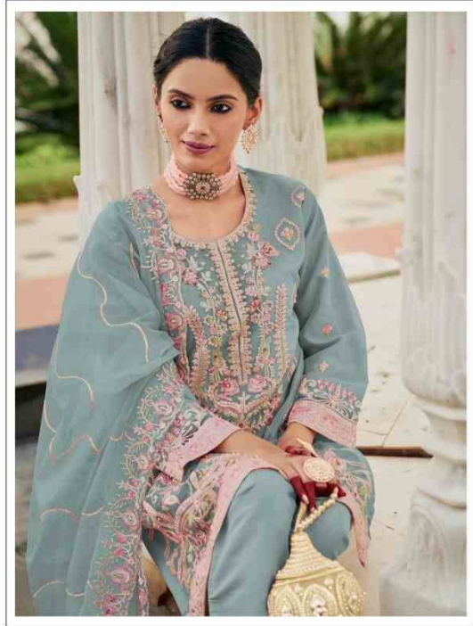
MR -122 B