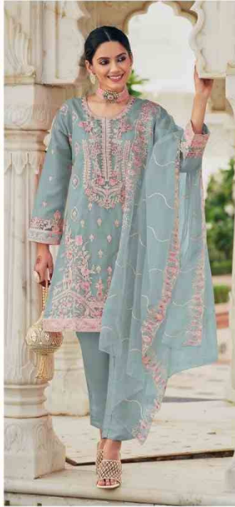
MR -122 B