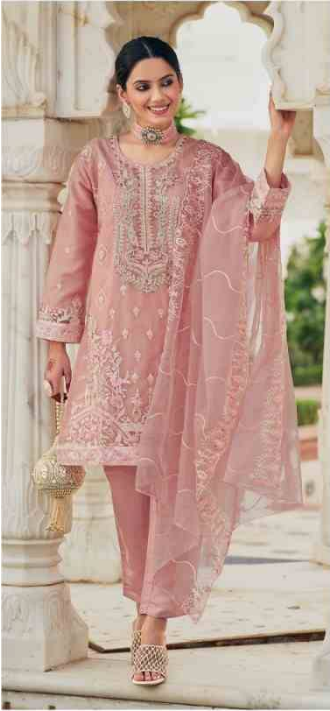
MR -122 A

DUPATTA:- ORGENZA WITH WORK WITH 4SIDE CUT WORK LACE