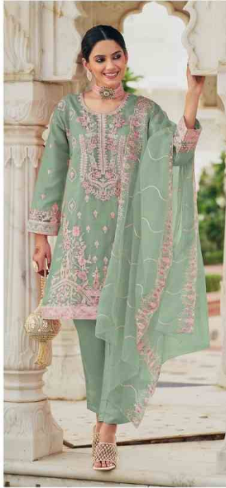
MR -122 C