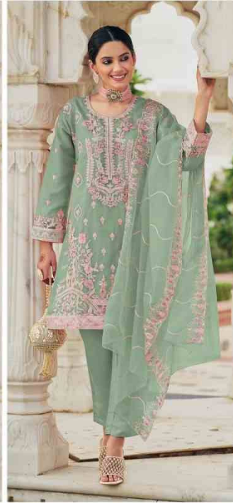
MR -122 C