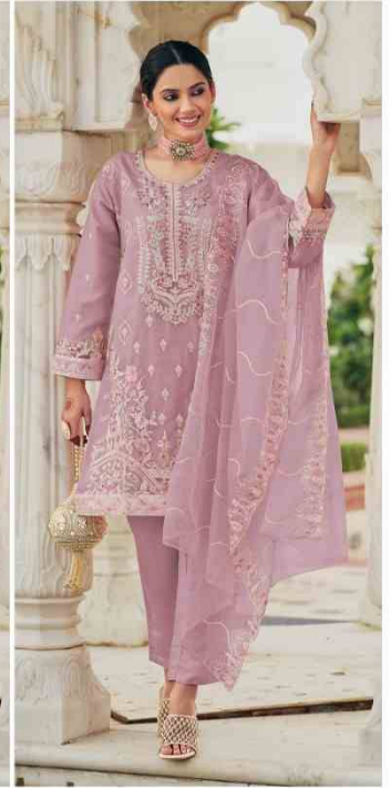
MR -122 D