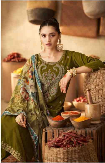
ADD SHINE TO YOUR ETHNIC WARDROBE WITH THIS FARLOU'S DESIGN DRESS