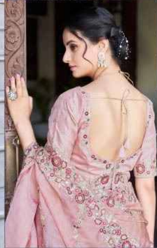
D.No.10009 Fabric Goldie Laheria Pal Fashion with a Grace