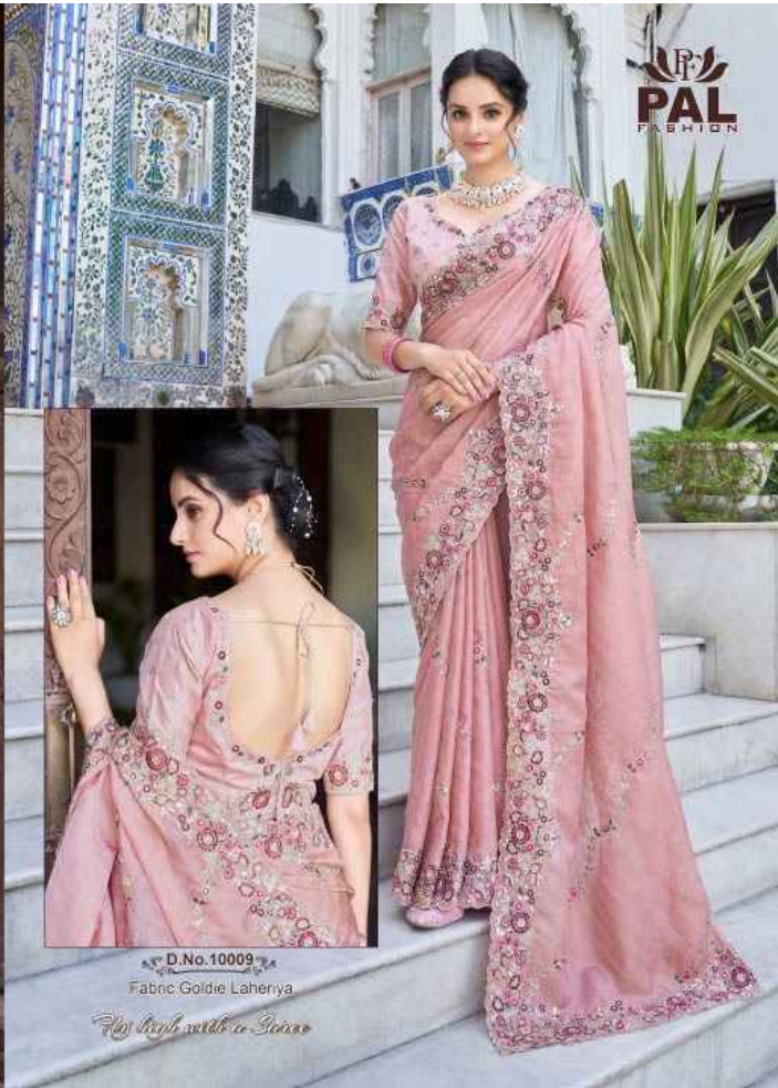
D.No.10009 Fabric Goldie Laheriya