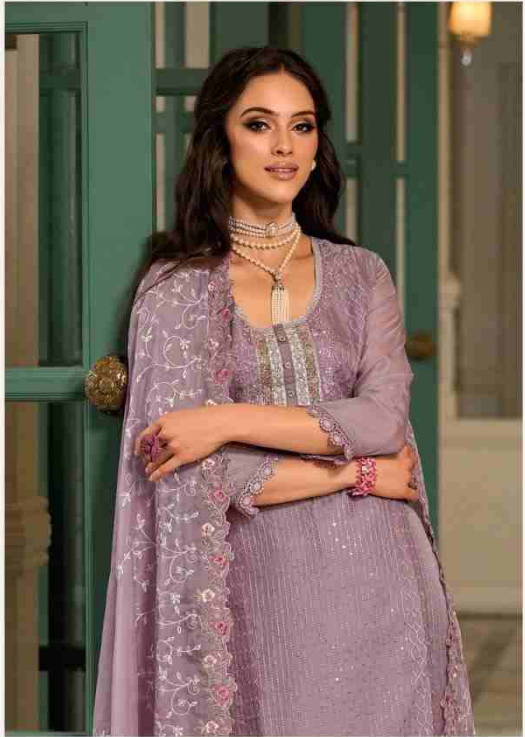
Classic A GIRL SHOULD BE TWO THINGS: CLASSY AND FABULOUS