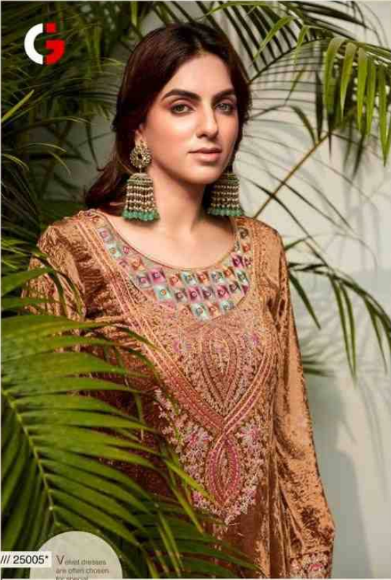
/// 25005* Velvet dresses are often chosen for special occasions like weddings and gowns.