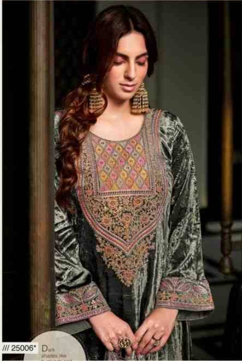
/// 25006* Dyes shades like burgundy and emerald are popular for velvet dresses.