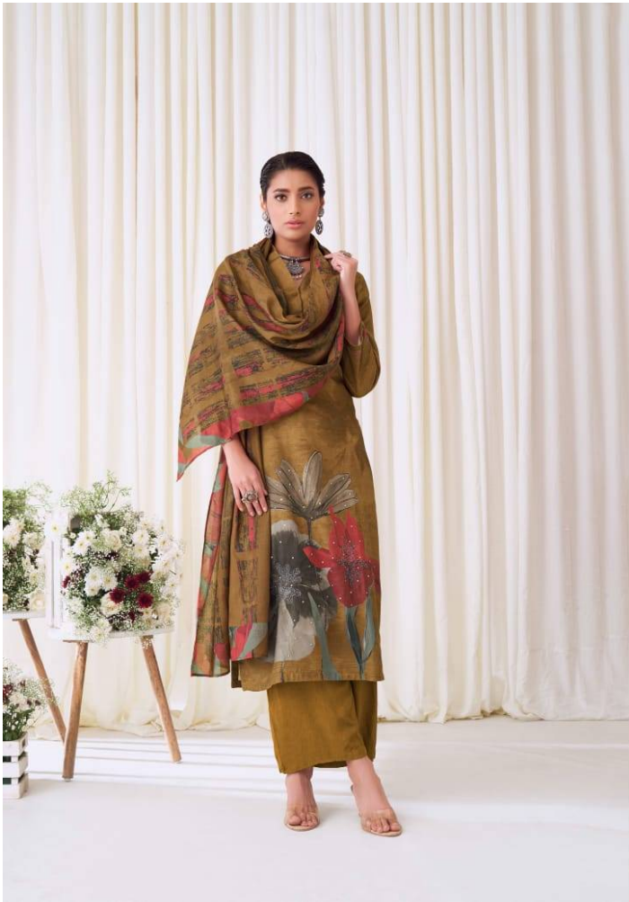
BLOTCHED | FLORAL 1734