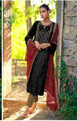
❏ D.10468 ❏