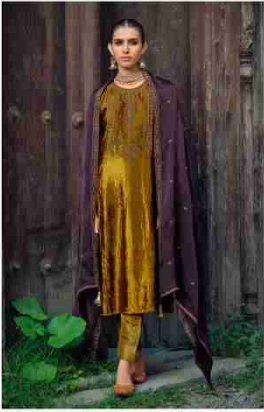
❏ D.10463 ❏