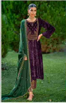
❏ D.10464 ❏