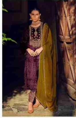
❏ D.10465 ❏