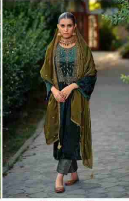
❏ D.10462 ❏