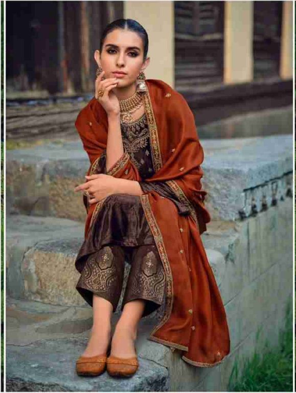
❖ D.10467 ❖