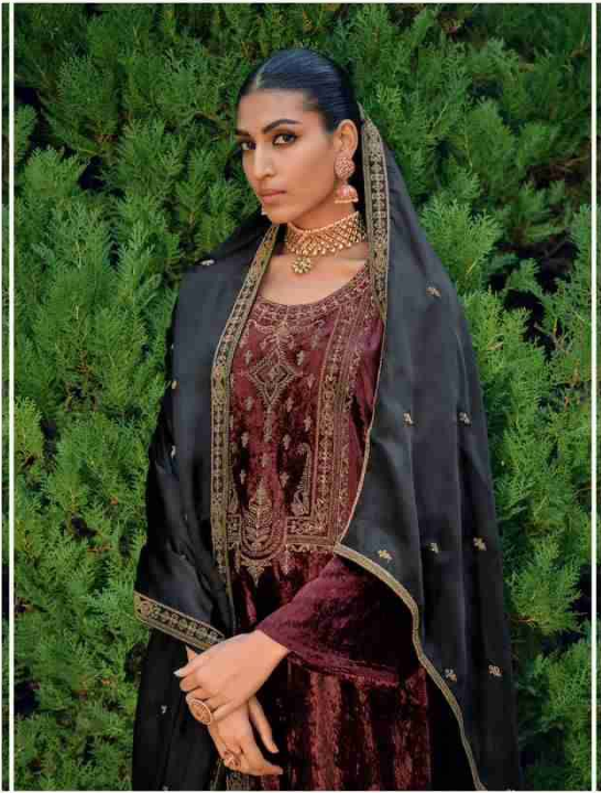
❖ D.10461 ❖