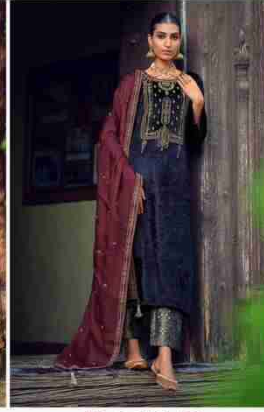
❏ D.10466 ❏