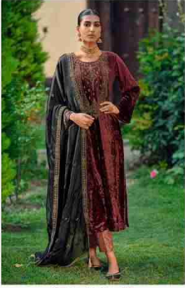
❏ D.10461 ❏