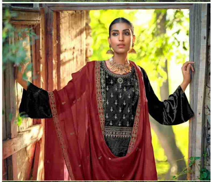
❖ D.10468 ❖