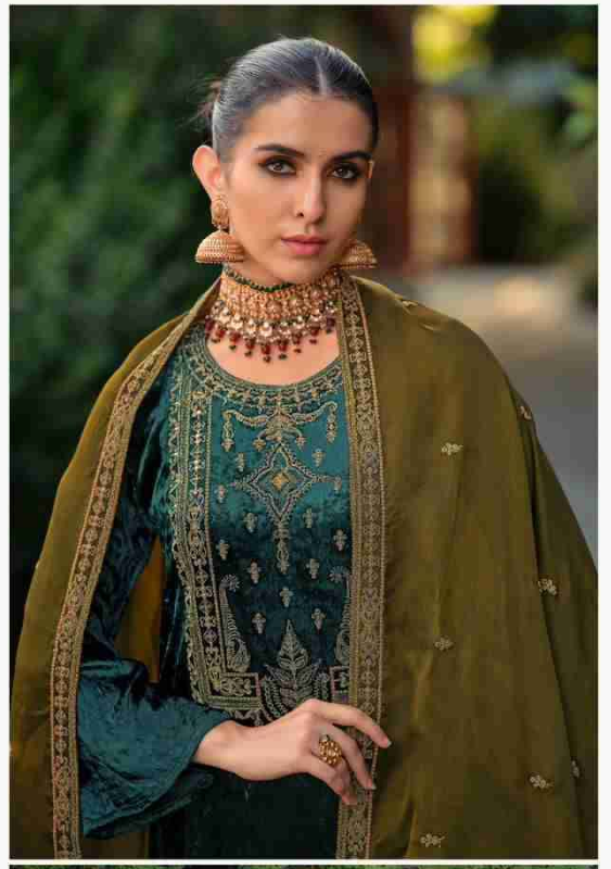
❖ D.10462 ❖