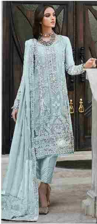
D - 5424 A