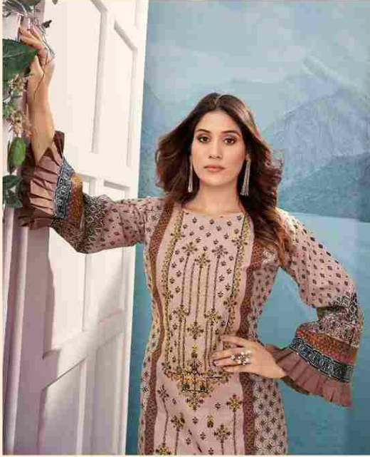
The way I dress depends on how I feel. I never have to push myself up. Usually, it just feels like it works.