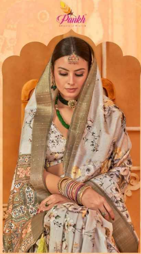
the royale ensemble