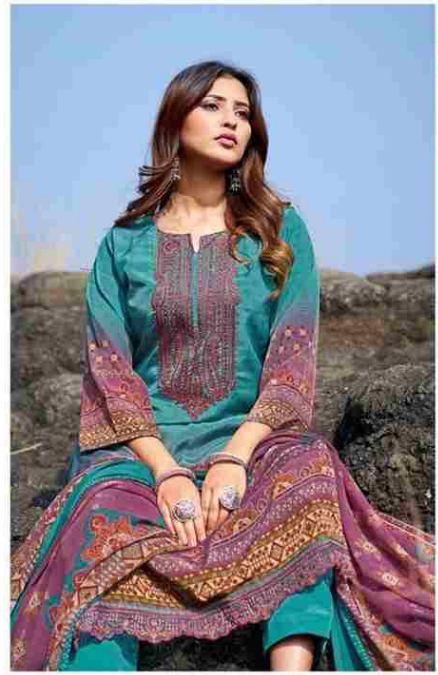
Surreal Artistry PORTRAYING THE SUBTLE ROYALTY OF A WOMAN