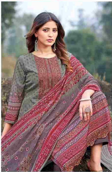
Crafted to Perfection Luxury in Every Loop: Unleash the Beauty of Bespoke