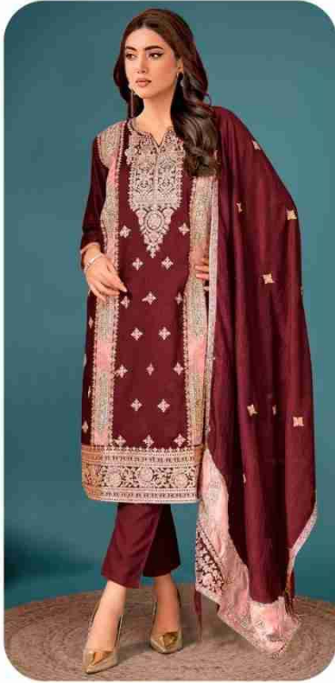
D.No 239 A