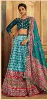
*** 2104 ***