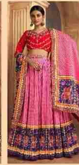
*** 2109 ***