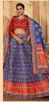
*** 2103 ***