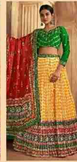
*** 2108 ***