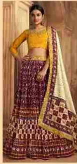
*** 2105 ***