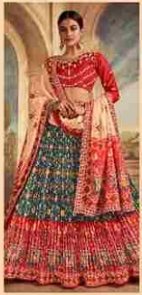
*** 2101 ***