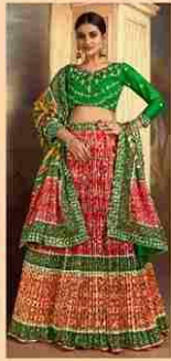
*** 2102 ***