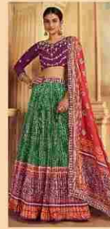
*** 2107 ***