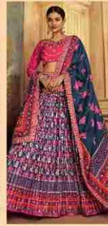
*** 2106 ***