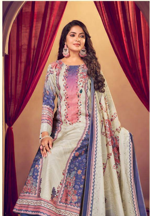
Primrose Classic outfit for an afternoon soiree. Beautiful cream colored long kurta adorned with dainty patterns and matched with long flowy sharara pants makes a great look.