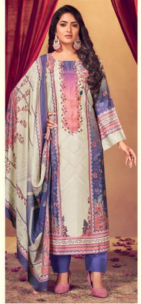
— 10454 —