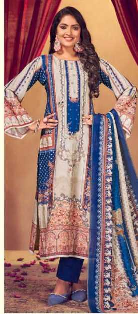
— 10453 —