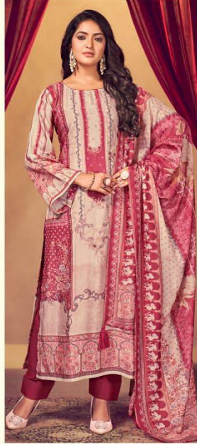
— 10452 —