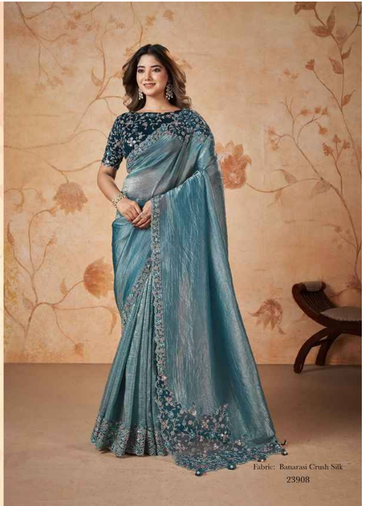
Fabric: Banarasi Crush Silk 23908