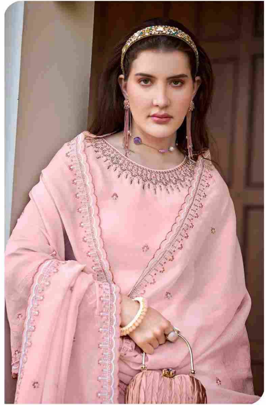
REFRESHES IT'S DRESSES WITH BOLD DESIGN