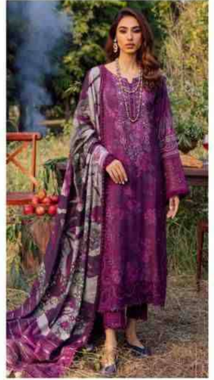
M - 43