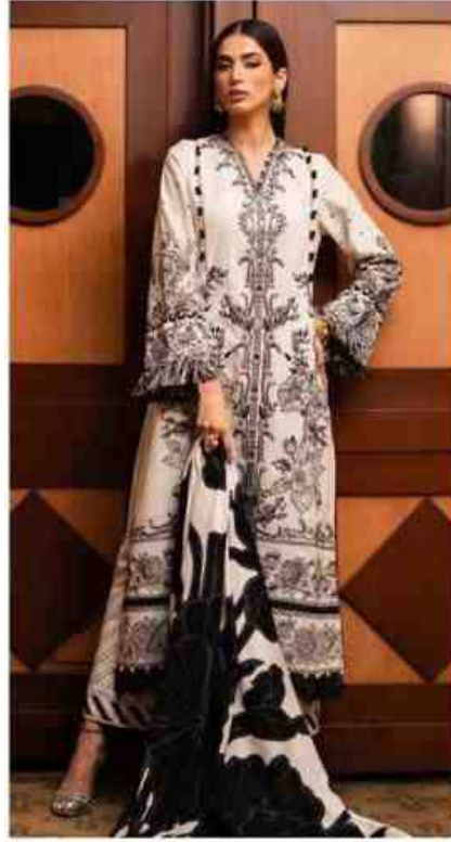
M - 42