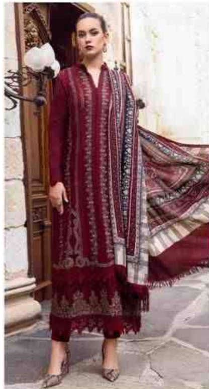
M - 45