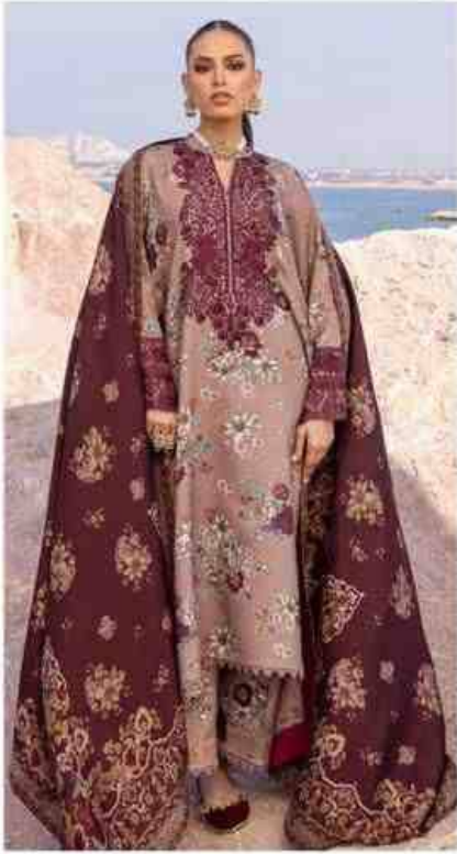
M - 41