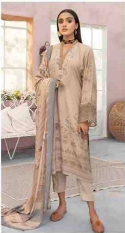
M - 44