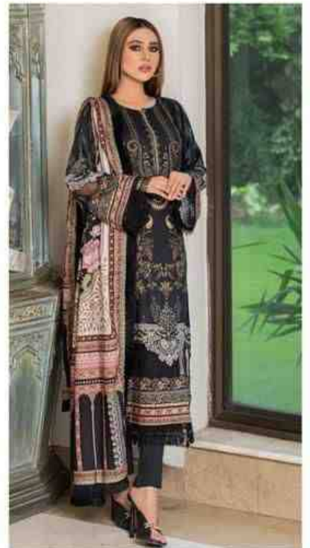
M - 46