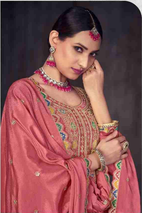
A blend of colors that highlight every corner of the attractive designs that in turn adorn you with vast beauty