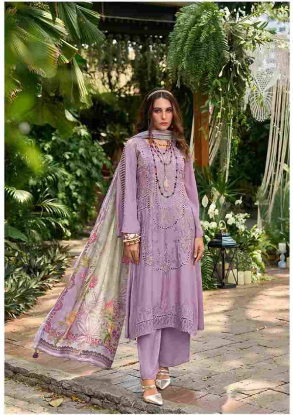
Neishi : 1005