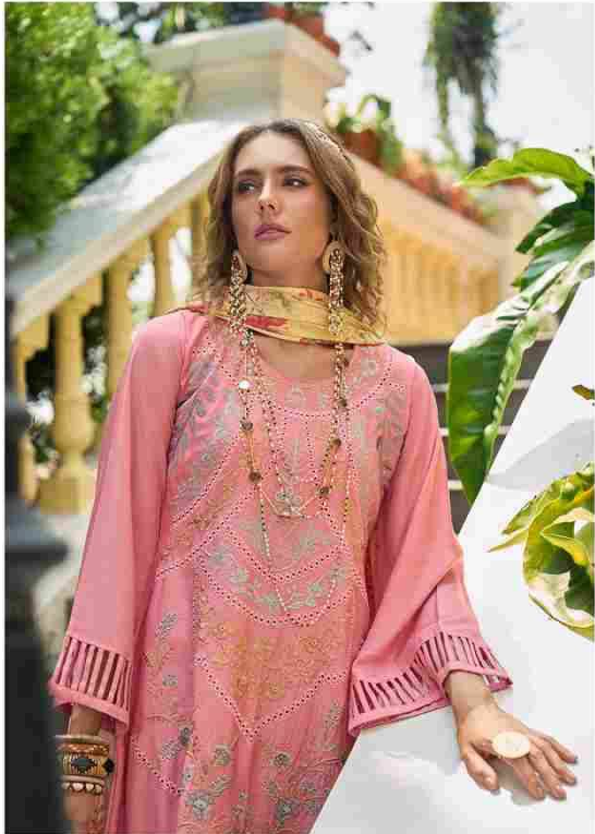
Neishi : 1001