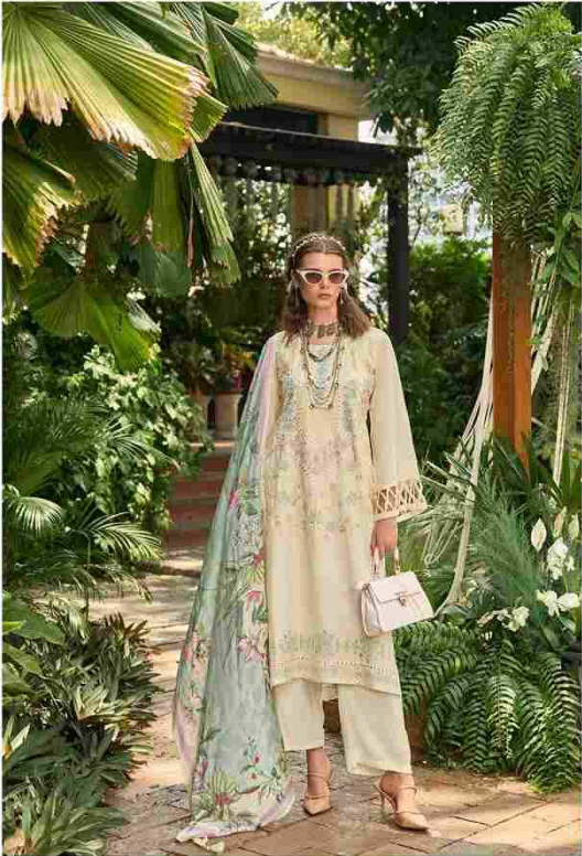
Neishi : 1004