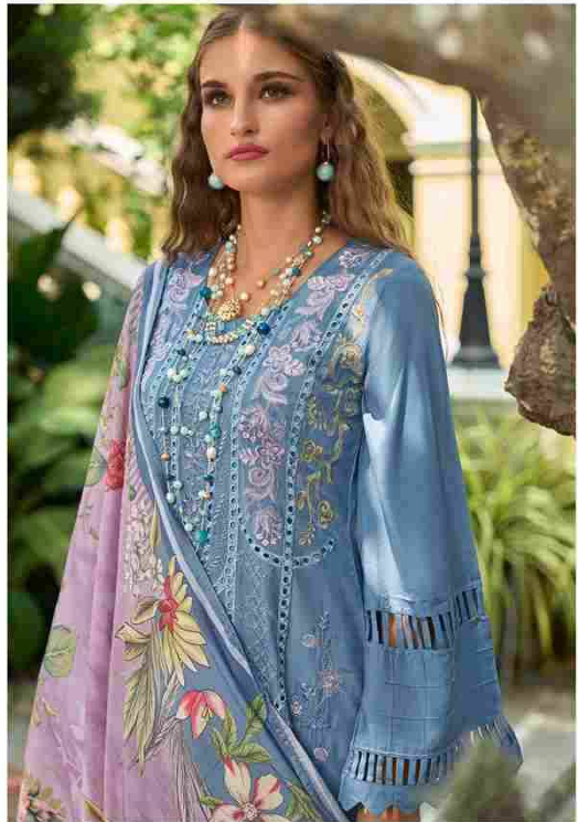
Neishi : 1003