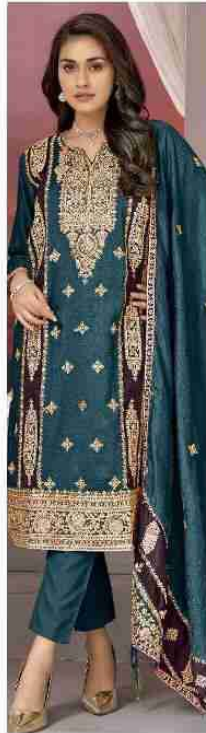
D.NO.168 - A