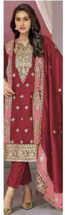
D.NO.168 - D