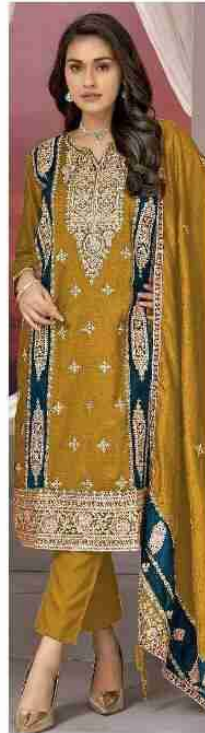
D.NO.168 - B