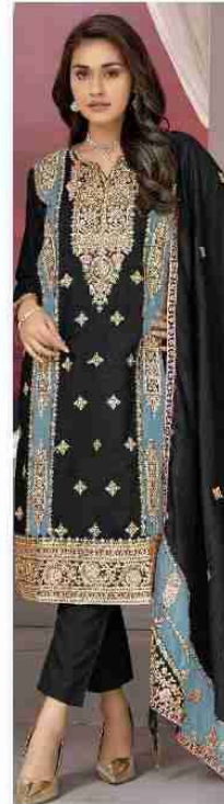
D.NO.168 - C