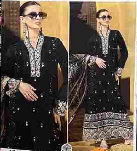
ADAN LIBAS ZAHARA COLLECTION TOP: Embroidered Cotton with Heavy Embroidery Work BOTTOM: INK