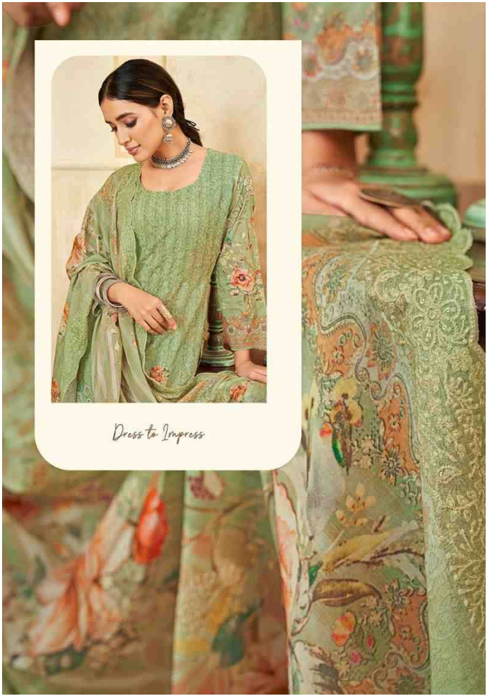
Dress to Impress