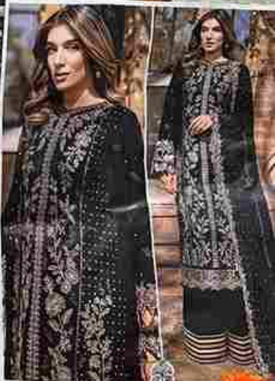
FARASHA VOL. 1 ZAHARA TOP - Cambric Cotton With Heavy Embroidery