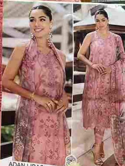
ADAN LIBAS LAWN COLLECTION VOL. 2 TOP: Cambric Cotton With Heavy Embroidery Work BOTTOM: D.No:103 DUPATTA