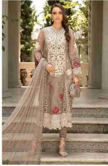
D.No | 264