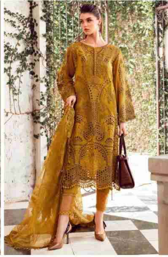
D.No | 265