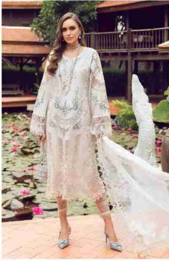
D.No | 263

TOP - Cotton With Embroidery DUPATTA - Nazmeen With Embroidery Work BOTTOM - Cotton