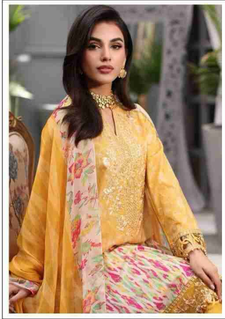
SANA SAFINAZ MUZLIN COLLECTION VOL - 01