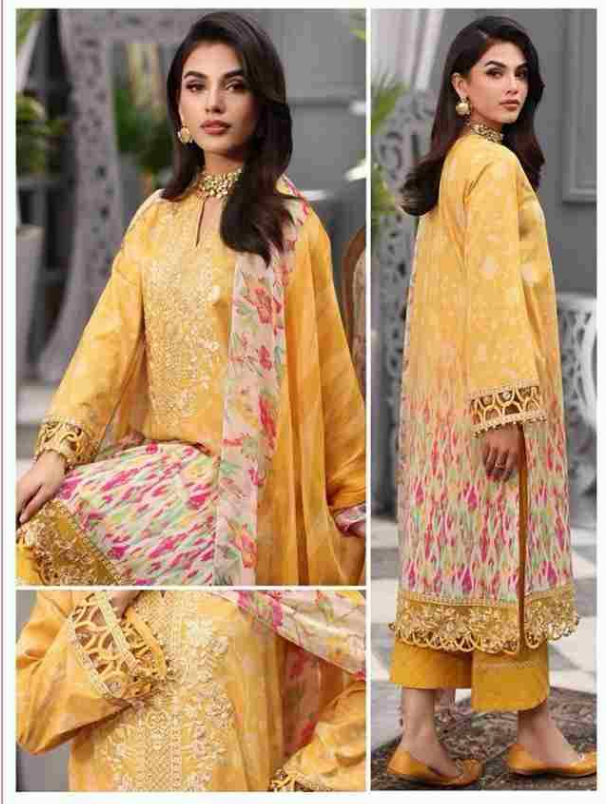
SANA SAFINAZ MUZLIN COLLECTION VOL - 01