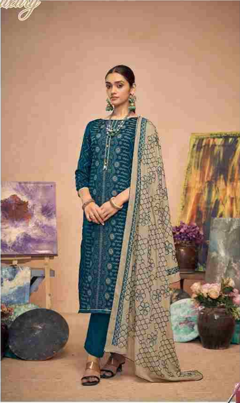
An expression of true luxury inspired by the royals. D.N.94003