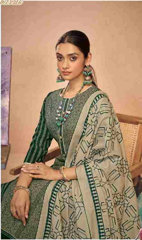
Classic adorned with pastel hues, a truly bridal dream! D.N.94002