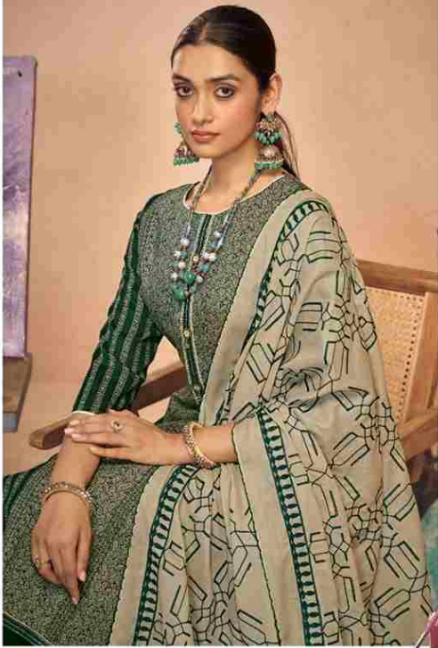
Classic adorned with pastel hues, a truly bridal dream! D.N.94002