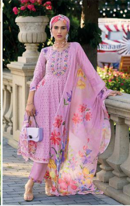
* 42714 *