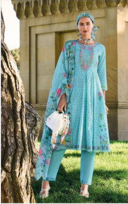
* 42713 *