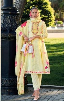
* 42712 *