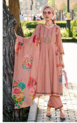
* 42715 *