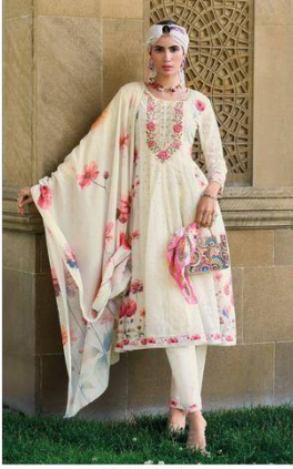
* 42711 *