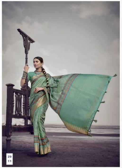
AS SERENE AS THE NATURE