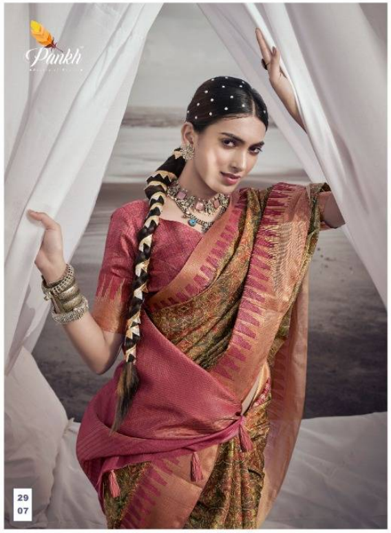
A9-FRESH AS THE BREEZE