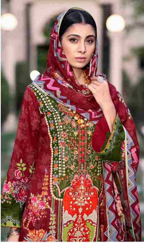
POWERFUL ART The intricate embroidery, vibrant colors, and bold patterns of this shawl are a true work of art. It is a masterpiece of traditional craftsmanship, featuring a rich palette of red, green, and gold. The design is a harmonious blend of floral motifs and geometric patterns, creating a visually striking and culturally significant piece. The shawl is made of high-quality fabric, ensuring durability and comfort. It is a perfect accessory for any occasion, adding a touch of elegance and tradition to your ensemble.