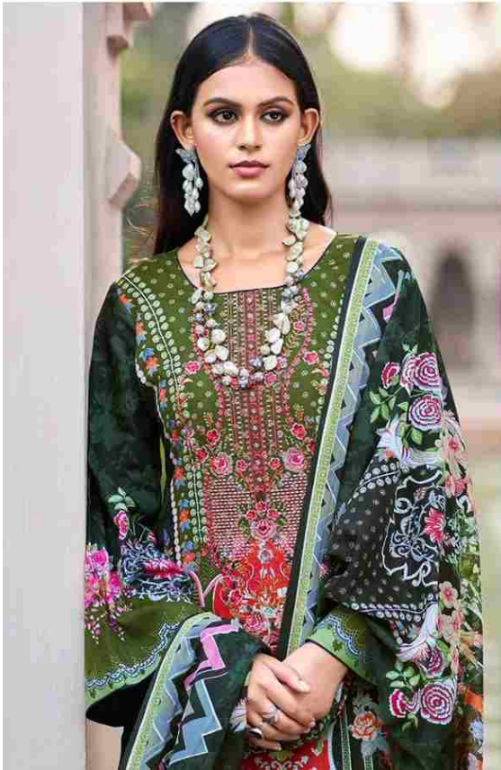
EMBRACE ELEGANCE This ensemble is a masterpiece of traditional Pakistani embroidery, featuring intricate floral and geometric patterns in vibrant colors. The outfit is made of high-quality fabric and is perfect for formal occasions. The shawl is a beautiful addition to the ensemble, adding a touch of elegance and warmth. The accessories are also beautifully crafted, completing the look.