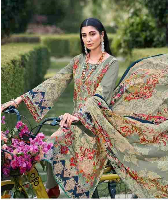
REFLECTING YOU www.riazarts.com | www.guzarish.com | www.riazarts.com | www.guzarish.com | www.riazarts.com | www.guzarish.com