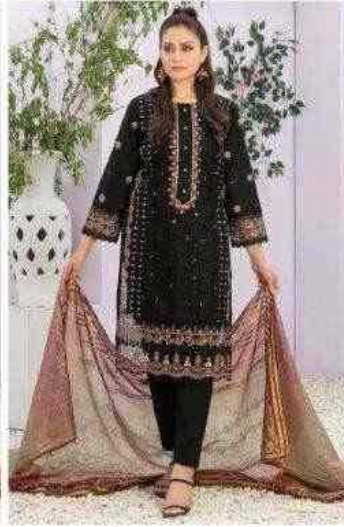
D.No 254 C