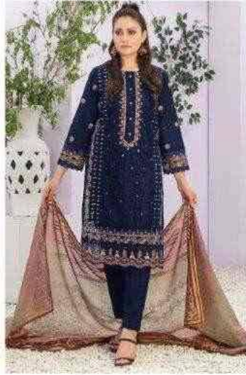
D.No 254 B