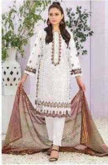
D.No 254 A

TOP - Cotton With Embroidery DUPATTA - Shiffon/ Cotton With Digital Print BOTTOM - Santoon