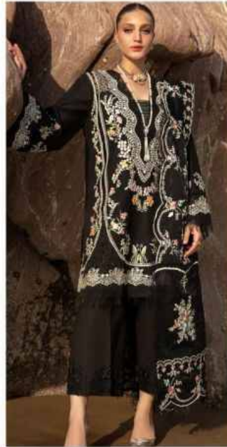
D NO 1003