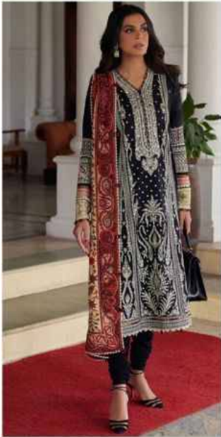
D NO 1001