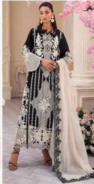
D NO 1002