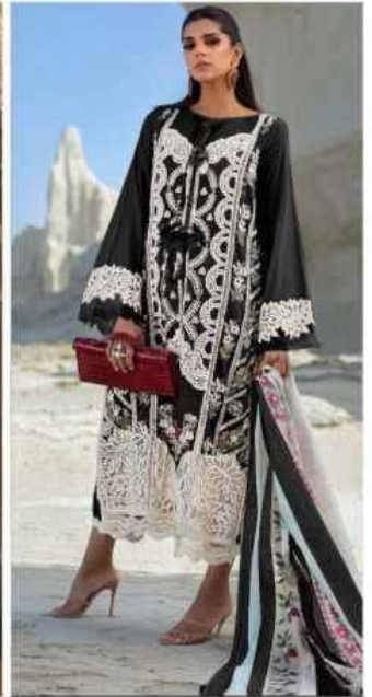
D NO 1004