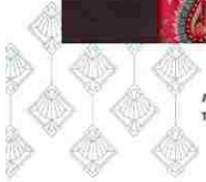
A GLORIOUS TRIBUTE TO A WOMAN 1194