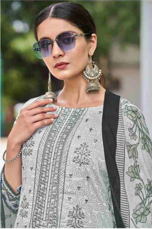
"Cultural Elegance, Quality & Bloom, Dresses that Exude Beauty & Perfume!"