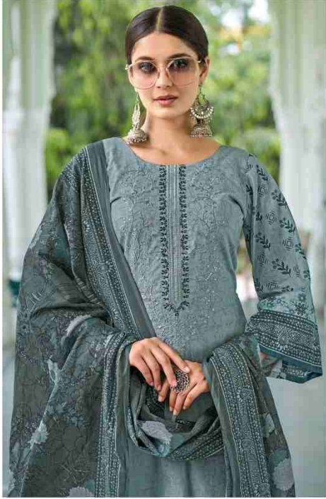
"Fabrics of Grace, Dresses that Embrace – Unveiling Your Radiant Culture."