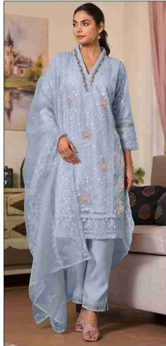
B 72 B