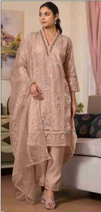
B 72 A