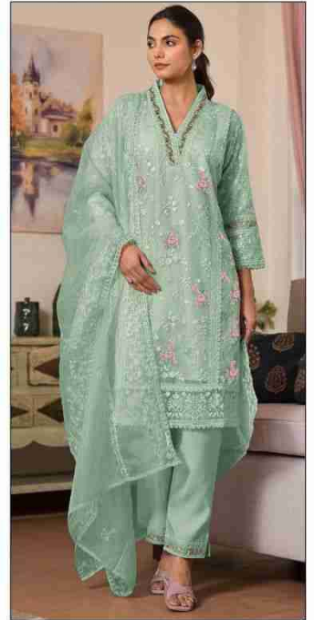
B 72 D