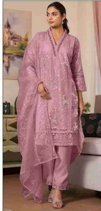
B 72 C