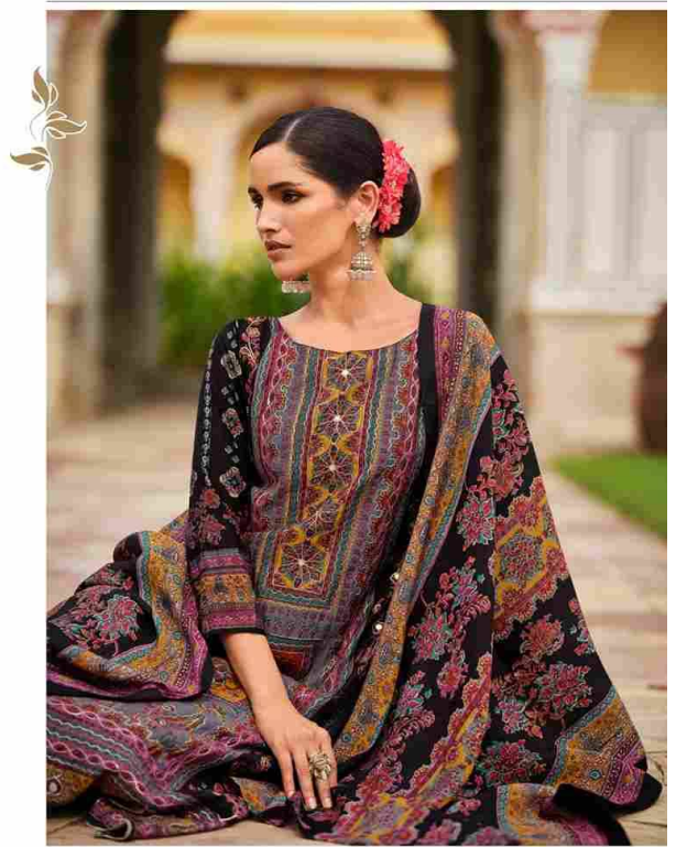
Being your stunning best to match the elegance occasion. Your stunning side this season.