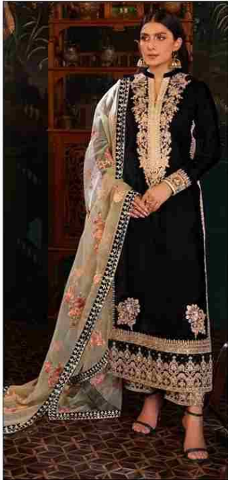
S - 324 A