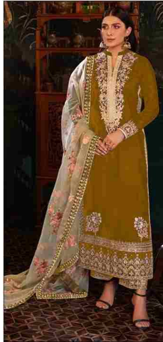
S - 324 B