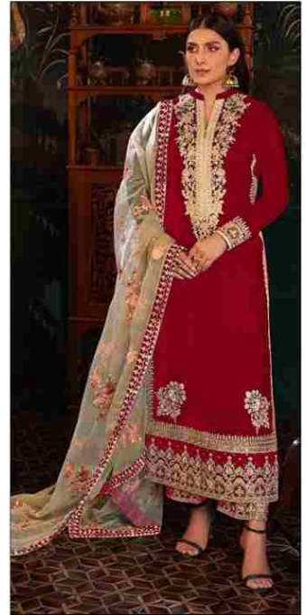
S - 324 D