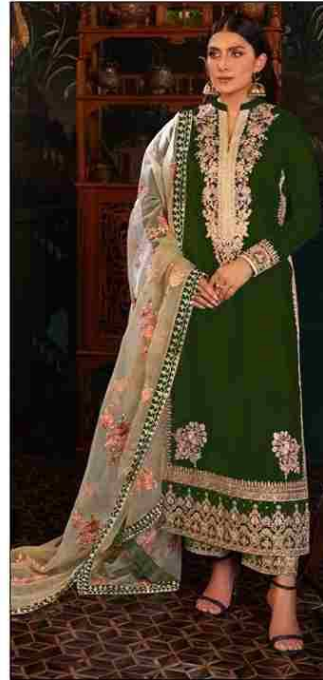
S - 324 C