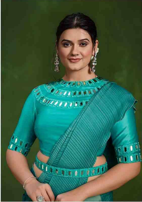
The alluring effect of a masterpiece with intricate beauty makes it an exquisite piece of fashion craft