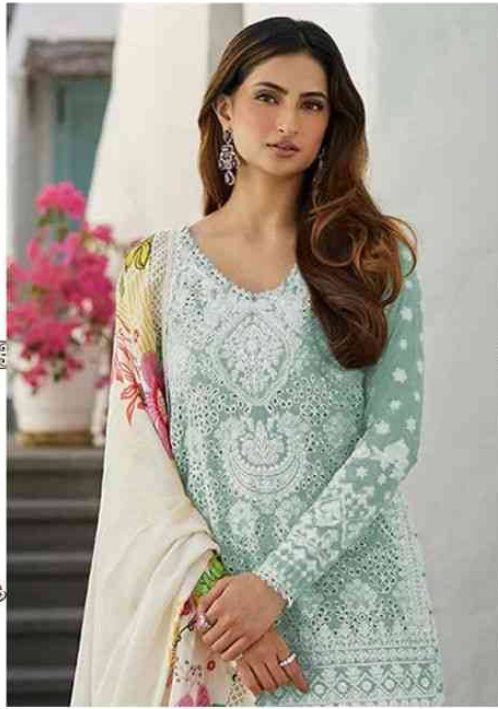
D.NO.176 - B

TOP - RAYON COTTON WITH EMBROIDERY WORK BOTTOM - RAYON COTTON WITH EMBROIDERY WORK DUPATTA - TEBBY SILK WITH DIGITAL PRINT 4 SIDE LEC