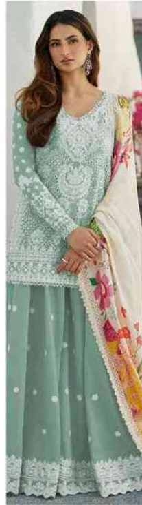
D.NO.176 - B