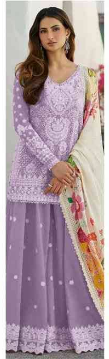
D.NO.176 - D