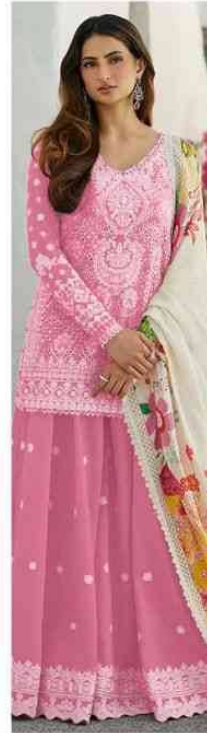
D.NO.176 - C