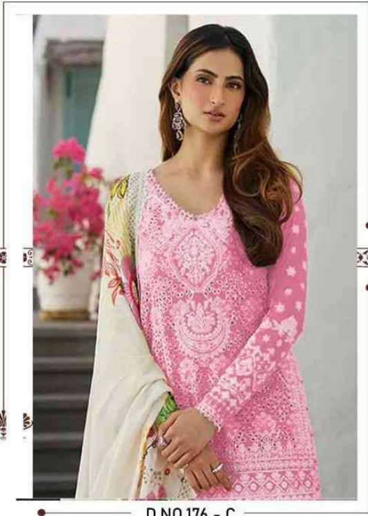
D.NO.176 - C

TOP - RAYON COTTON WITH EMBROIDERY WORK BOTTOM - RAYON COTTON WITH EMBROIDERY WORK DUPATTA - TEBBY SILK WITH DIGITAL PRINT 4 SIDE LEC