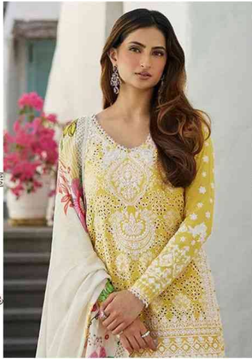
D.NO.176 - A

TOP - RAYON COTTON WITH EMBROIDERY WORK BOTTOM - RAYON COTTON WITH EMBROIDERY WORK DUPATTA - TEBBY SILK WITH DIGITAL PRINT 4 SIDE LEC