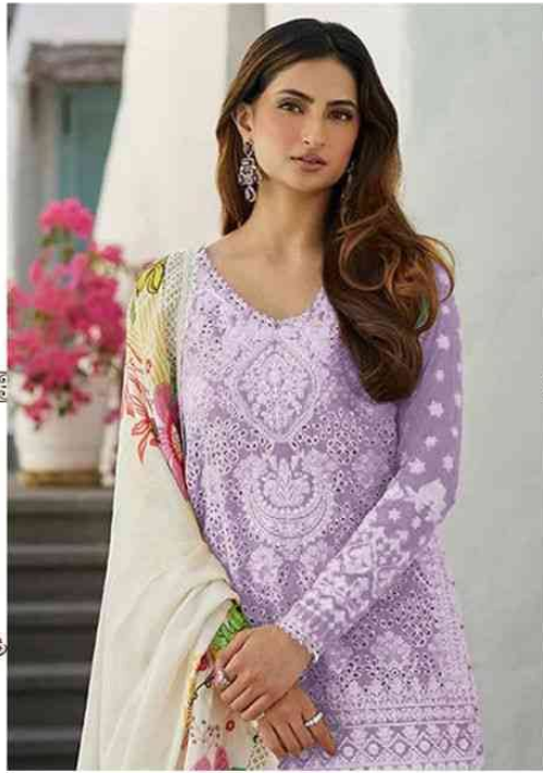
D.NO.176 - D

TOP - RAYON COTTON WITH EMBROIDERY WORK BOTTOM - RAYON COTTON WITH EMBROIDERY WORK DUPATTA - TEBBY SILK WITH DIGITAL PRINT 4 SIDE LEC