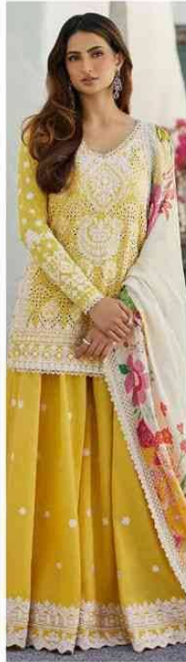
D.NO.176 - A