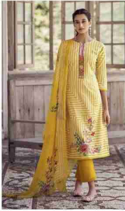
D No / 38003