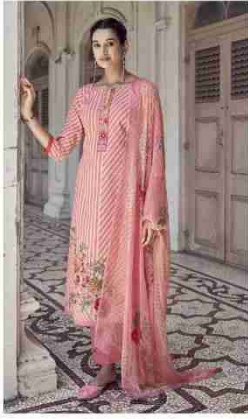
D No / 38001