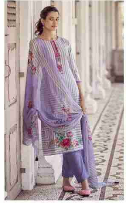
D No / 38006