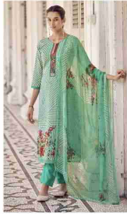
D No / 38004