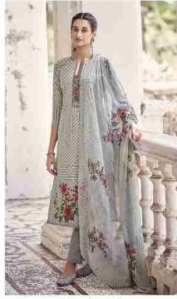
D No / 38002