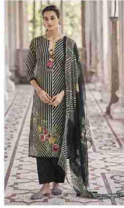
D No / 38005