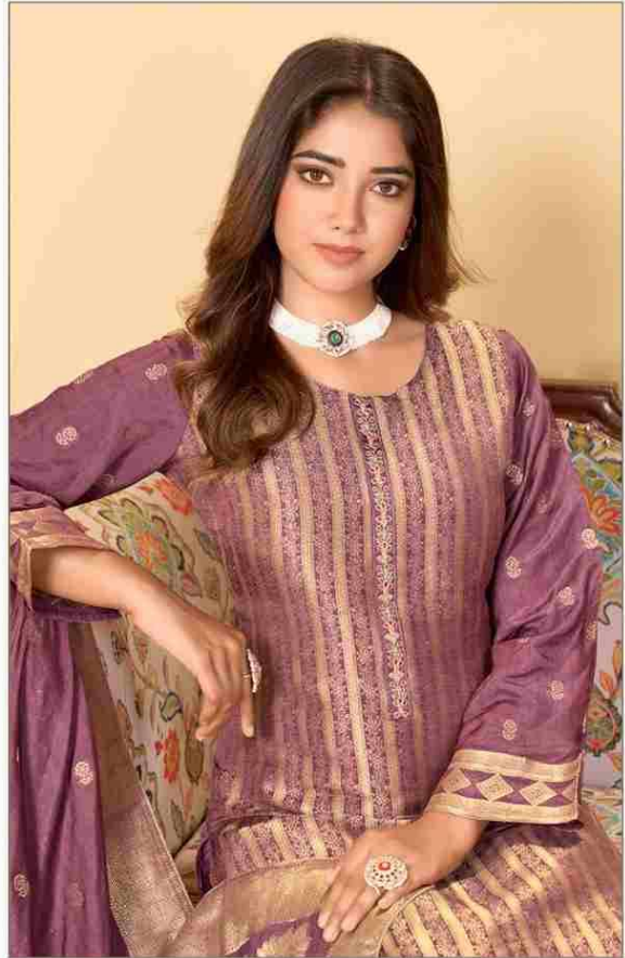
"Flexibility with yourself and your looks is one's soft confidence. You're willing to put in your zamana with whatever comes from within you."