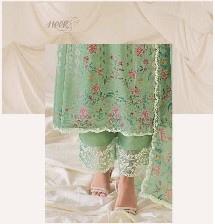
9446 | celebrating refinement of floral motifs, intricately embroidered with white thread on the fabric, accompanied by shimmering sequins and with the element of lace.