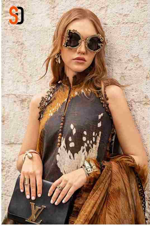
16003 A M PRINT-16