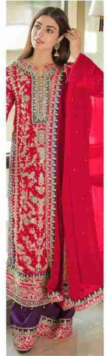
D.NO.180 - D