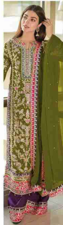
D.NO.180 - C