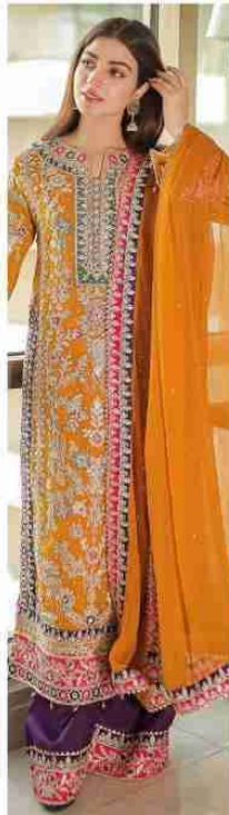
D.NO.180 - A