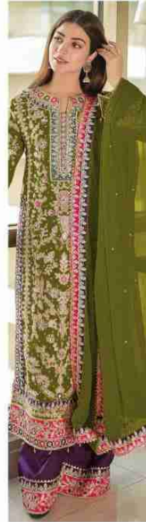
D.NO.180 - C