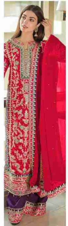
D.NO.180 - D