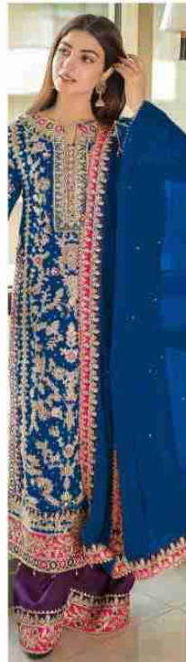
D.NO.180 - B